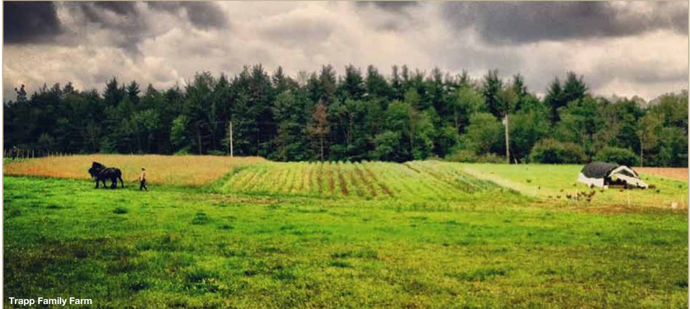
Trapp Family Farm