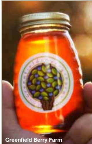
Greenfield Berry Farm