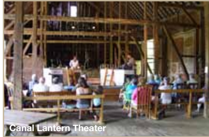
Canal Lantern Theater