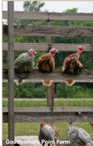
Goatfeathers Point Farm