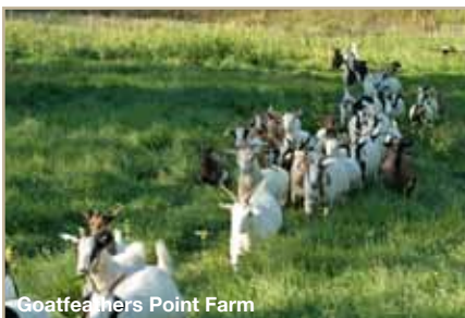
Goatfarmers Point Farm

While Countryside Initiative farm enterprises will more closely resemble the latter, they carry an additional affirmative responsibility to use only approved sustainable production practices. Hence, the productive component of Initiative farm rent will be benchmarked at 10% of gross farm income. That benchmark will be reduced by 1% of gross income for certified organic producers since verification of sustainable production practices will be largely assumed by the certifying agency.