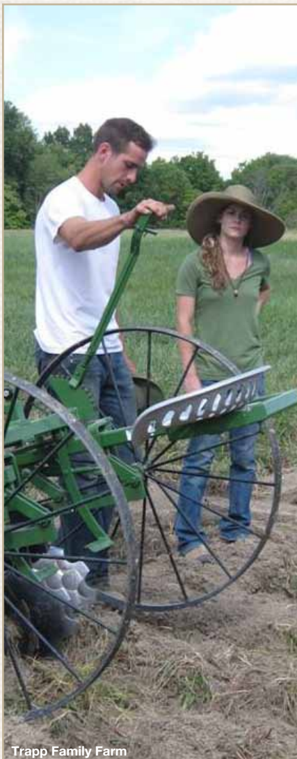
Trapp Family Farm