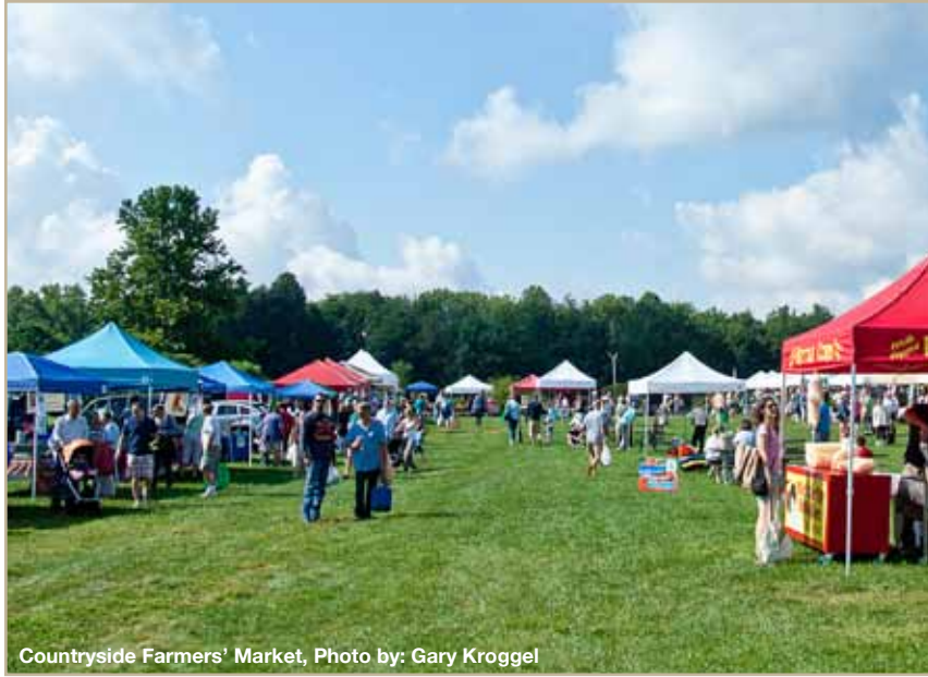
Countryside Farmers' Market