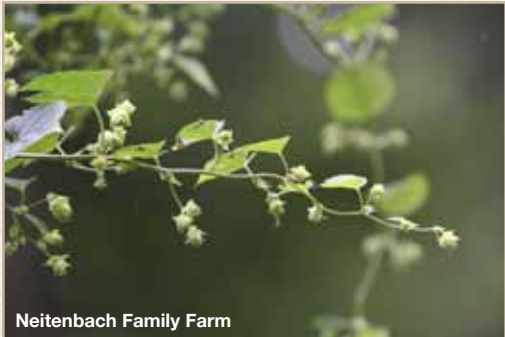
Neitenbach Family Farm

Countryside Conservancy 2179 Everett Road Peninsula, OH 44264 Phone: 330-657-2542 Fax: 330-657-2198 Web: www.cvcountryside.org