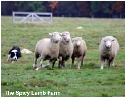
The Spicy Lamb Farm