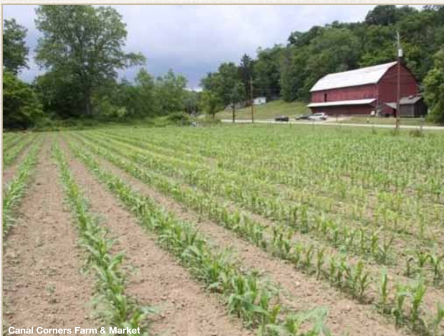
Canal Corners Farm & Market

CVNP is responsible “for preserving and protecting for public use and enjoyment, the historic, scenic, natural, and recreational values of the Cuyahoga River and adjacent lands of the Cuyahoga Valley...”