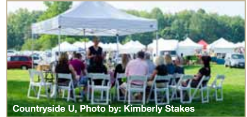
Countryside U