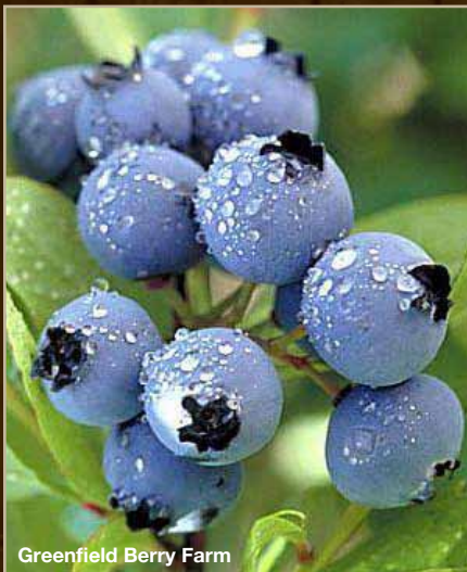
Greenfield Berry Farm