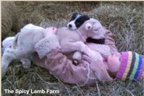
The Spicy Lamb Farm

Supplemental information is available to help potential proposers better understand the initiative in general, and the specific farm in the current offering. The following information is available on the CVNP and CVCC websites ( www.cvnv.gov/cvnv and www.cvcountryside.org ).